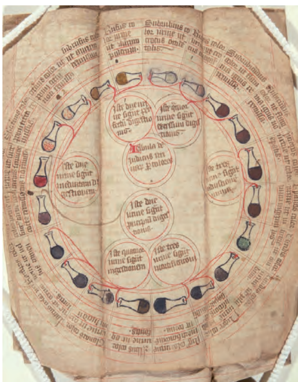
Fig. 1 Historical "urine wheel" for uroscopy

Used to diagnose various diseases based on the colour of the patient's urine. The colour is compared to the flasks pictured and the annotations will specify the state of digestion and lead to the "proper" diagnosis as well as prognosis.