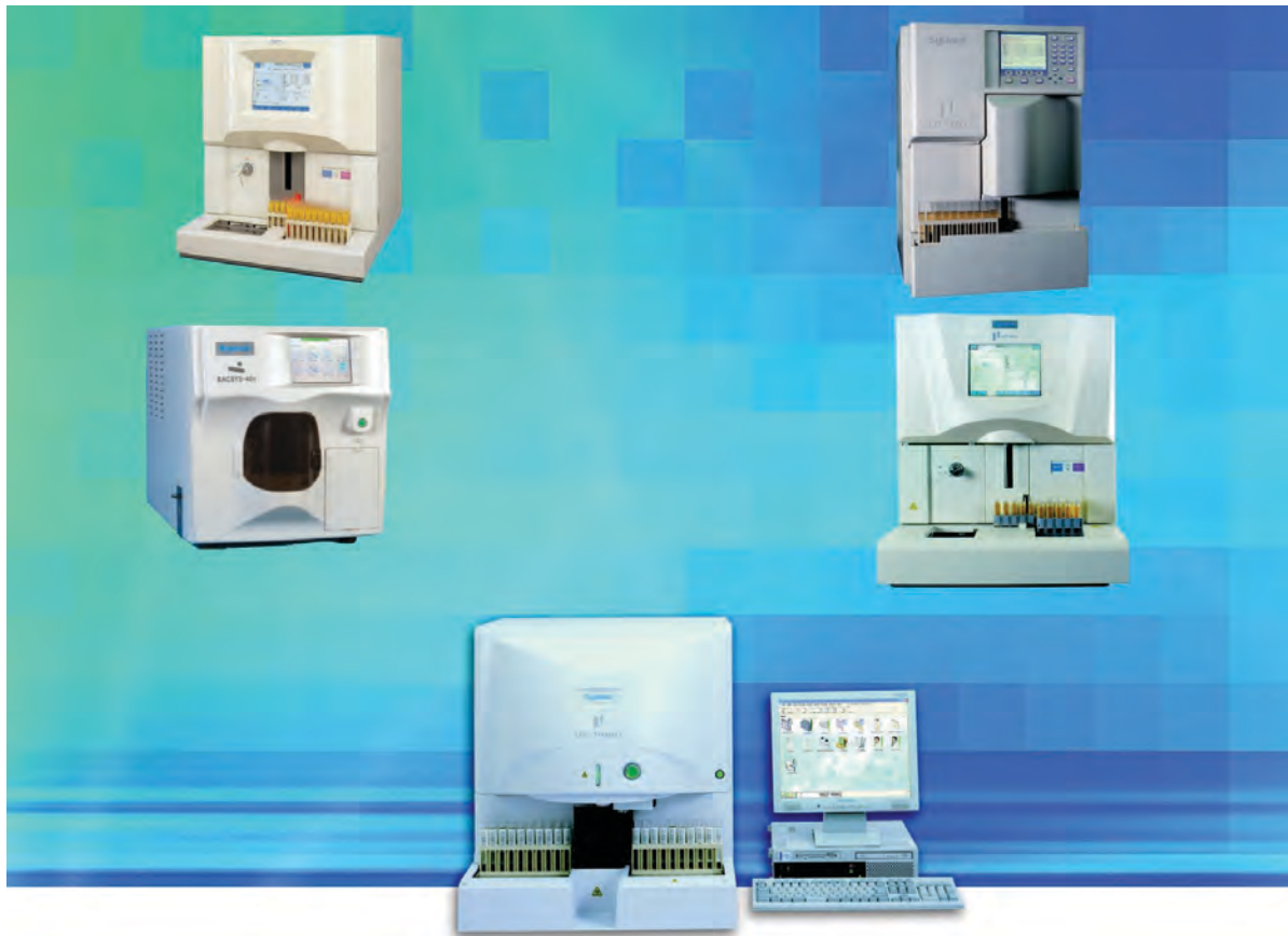
Fig. 2 Bringing urinalysis into the 21 st century with Sysmex urinalysis solutions

Technical solutions for this problem can be based on flow cytometry. To this end, cells in urine can be stained with fluorescent dyes for membranes and/or DNA. The combined analysis of scattered light and fluorescence allows the identification of particles as leukocytes or bacteria or even yeast-like cells. Analogously to automation in haematology, this allows a drastic reduction of turnaround time. The sample throughput of such analytical systems can reach up to 100 /hour. Sysmex has long provided solutions in this area and with its experience in fluorescence flow cytometry brought them into the new millennium ( Fig. 2 ).