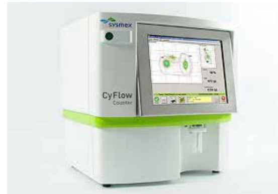
System to Test for CD4+ Lymphocytes

In addition, this system has acquired prequalification* by the WHO and has been promoted for introduction in countries and regions in which medical resources are limited. It improves the quality of HIV diagnosis and treatment in emerging and developing countries.