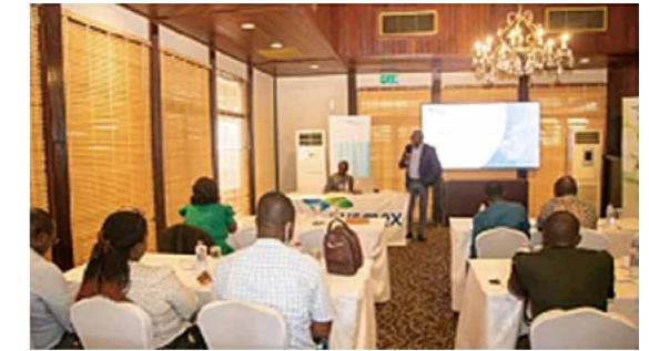
Seminar in Ghana

In fiscal 2023, Sysmex Corporation introduced an application (Caresphere™ XQC) for real-time external quality assessment in clinical laboratories on a trial basis in Ghana through the Ministry of Economy, Trade and Industry's "Feasibility Study Project on Emerging Business Opportunities in the African Market (AfDX)," to investigate local needs and issues related to the diffusion of services. Training on Caresphere™ XQC was provided to six medical facilities participating in the trial, allowing them to experience firsthand the value of the service offered. Seminars and other activities were also held to promote understanding of quality improvement in clinical testing among local governments, industry associations, and medical institutions. By leveraging not only digital solutions but also Sysmex's expertise in supporting the spread of external quality assessments in Asian countries over the years, and the public-private partnership scheme for this project, we will contribute to the improvement of local medical standards by promoting the understanding of external quality assessments, and by developing human resources through operational training provided to the Ghanaian Ministry of Health, as well as medical institutions in Ghana.