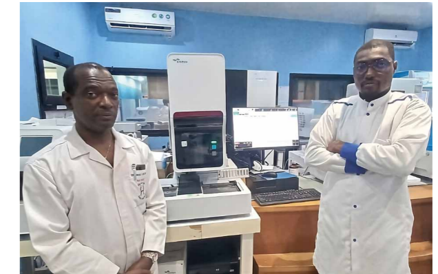
Interview with Medical Professionals in Cote d'Ivoire

We are grateful for the way Sysmex analyzers have revolutionized our laboratory with their performance and efficiency.