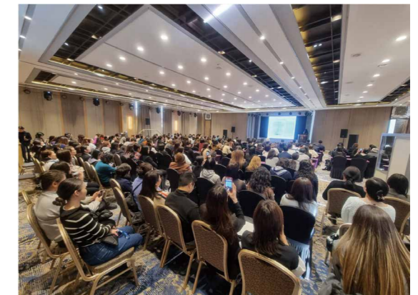
Survey Report Meeting in Mongolia

In China, its hematology reference counter has been employed as a National Standard* for Blood Cell Count since 2002, and the registration inspections and external quality assessments for all blood cell counters in China have been conducted using the reference counter provided by Sysmex as a standard. In addition, Sysmex has been providing continuous support, such as technology transfer and exchange for hematology and reference measurement procedures, while also assisting in the creation of national clinical laboratory guidelines. Since 2019, it has leased the latest standard blood cell counters, contributing to improving the accuracy and standardization of hematology tests in China.