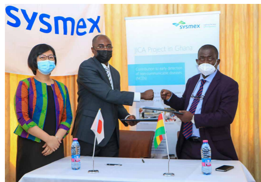
Presentation of JICA's collaboration program