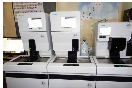
Equipment installed at KATH