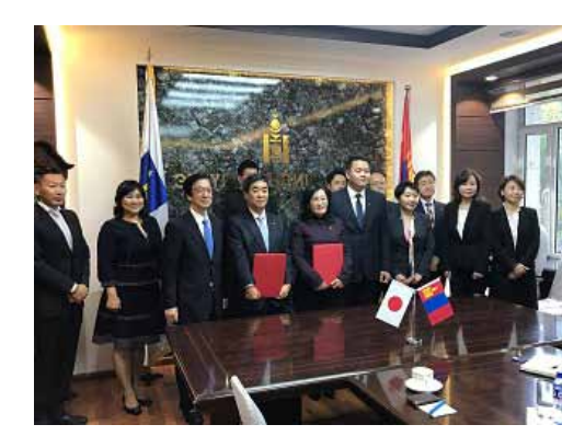
Signing ceremony with Mongolia's Ministry of Health

In Mongolia, Sysmex expanded its support activities to the hemostasis field in 2022. It has continued such activities in addition to working in the hematology, clinicalchemistry, and immunchemistry fields in which it had already carried out support activities. Sysmex provides technical and academic knowhow to local clinical laboratory technicians and supports the establishment and operation of a system of external quality assessmentsl of blood morphology tests conducted