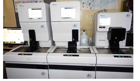
Presentation of JICA's collaboration program