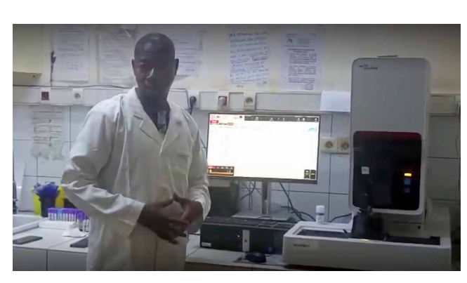
Interview with a Medical Professional in Burkina Faso

Conventional malaria tests take time, and their accuracy is low; however, using a Sysmex analyzer has made faster and more accurate diagnoses possible. The analyzer is easy to operate and can measure samples one by one or automatically measure multiple samples. With the analyzer, you can select an appropriate measurement method according to the purpose of use. It also enables you to acquire a great deal of information from a wide range of measurement targets,