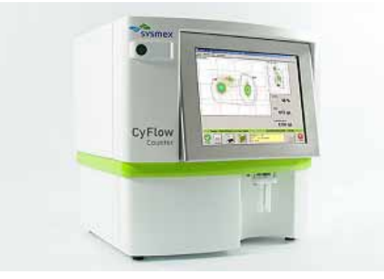
System to Test for CD4+ Lymphocytes

In addition, this system has acquired prequalification* by the WHO and has been promoted for introduction in countries and regions in which medical resources are limited. It improves the quality of HIV diagnosis and treatment in emerging and developing countries.